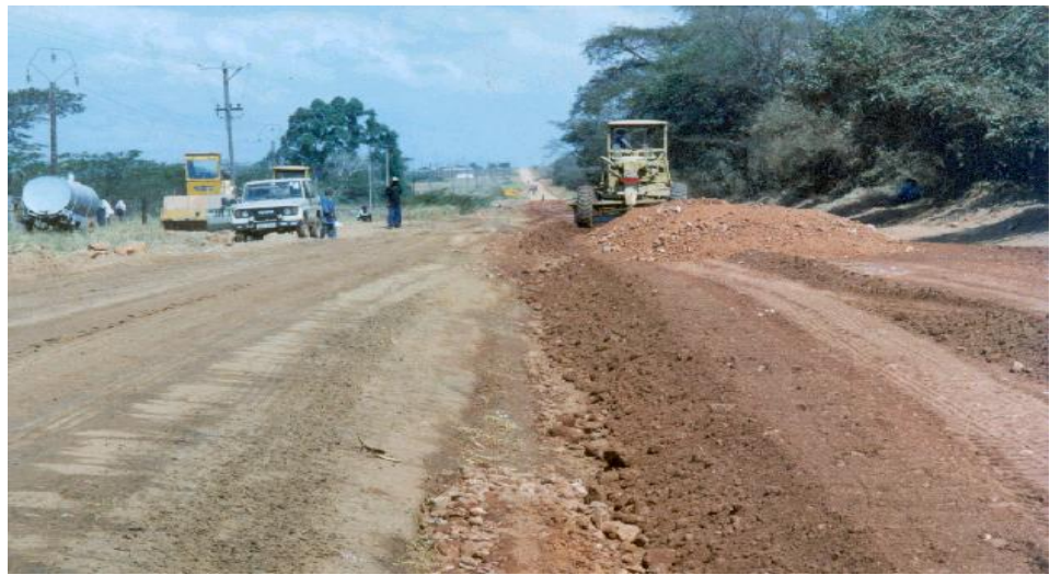
Road construction has been the cornerstone of the Zambian construction industry in the last few years

With the low levels of investment experienced in our construction industry this year ending, it is not surprising that most of our members and readers alike will welcome the end of this year and be looking forward to the beginning of the new year. The year 2001 will certainly be remembered as the year when the industry started with very great expectations for a construction boom, but ended up with a practical slump.