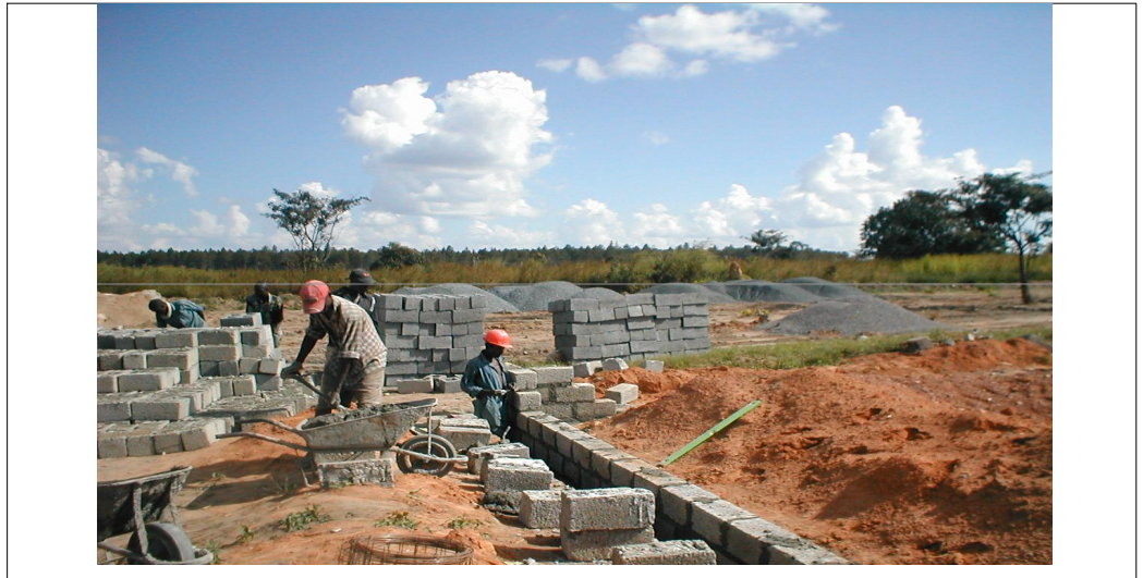
Zambian Contractors: Is there any hope of restoring their image?

This month we turn our attention to the severe public criticism that has been leveled on our local contracting firms, particularly those owned and run by indigenous Zambians. Our local contractors have come under severe criticism for alleged poor workmanship, especially in the roads sub sector. Indeed some of this criticism is very genuine, although some of it is totally baseless and without merit. In terms of contractor performance, there are basically three types of contractors: 1. The Good; being those that perform to client satisfaction 2. The