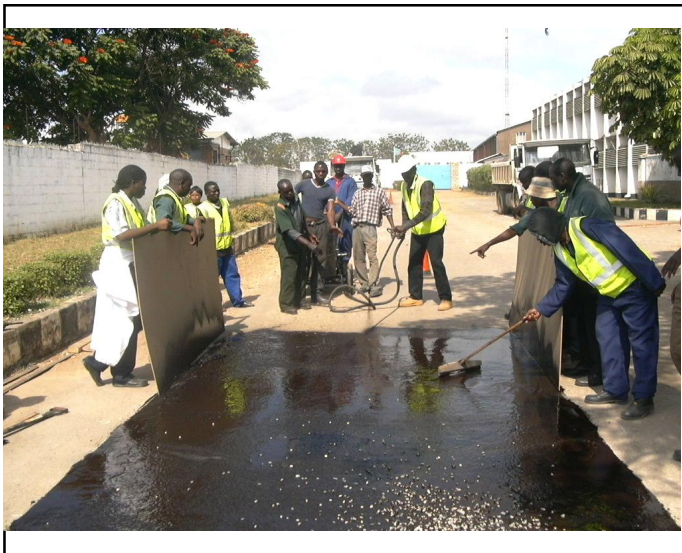
Students applying chip and spray