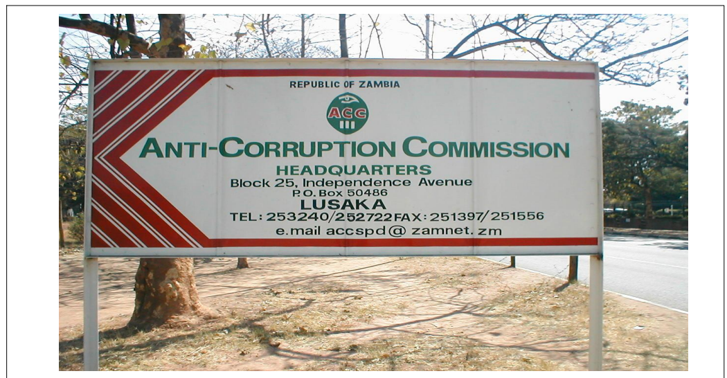
Anti-corruption Commission—Is it adequately equipped to address issues in construction?

The National Council for Construction (NCC) is this month compelled to contribute and comment on the ongoing debate concerning the public's perception of the levels of corruption in the global construction industry in general and the Zambian industry in particular. We must state from the outset that our action above follows two reports that we received in the month of March 2005 from 1. Transparency international (2005 Global Corruption Report: Special focus- Corruption in Construction