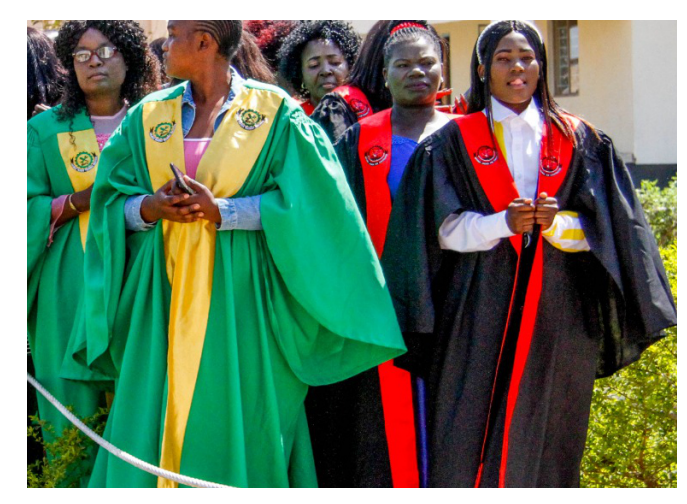
NCC Construction School - Skills bulletin